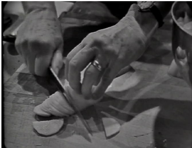
The French Chef. WGBH Boston.