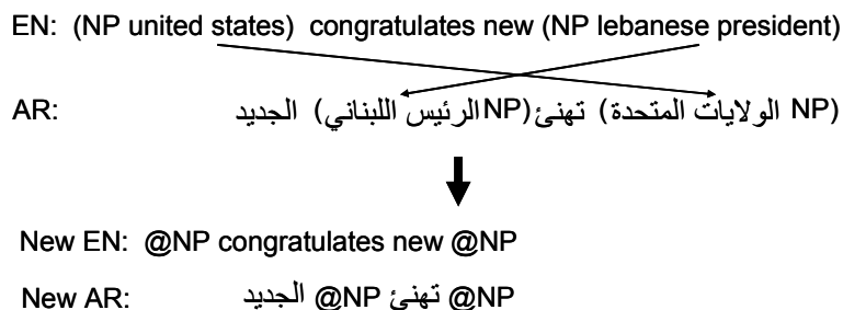
Figure 2: Tagging of NPs

To evaluate the accuracy of NP translations, and also to estimate how often the Arabic translation of an English NP is indeed an NP, a sample of NP translations was evaluated by an Arabic native speaker. 90% of the resulting Arabic translations were NPs. Out of these NPs, 11% had some irregularities such as missing articles in one side, etc. 10% of Arabic translations were either incorrect or not NPs (e.g. verb phrases).