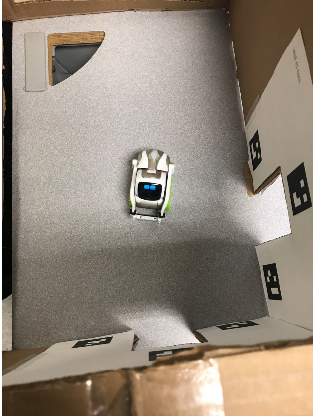
5. Cozmo finds the door