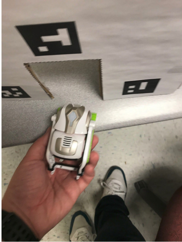
7. Cozmo gets out of the box