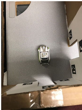
6. Cozmo enter to the second doorway