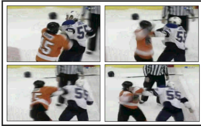
Fig. 1. Sample of a fight clip from our 1000-video database.

this respect, two prominent spatio-temporal descriptors are Space-Time Interest Points (STIP) and Motion SIFT (MoSIFT).