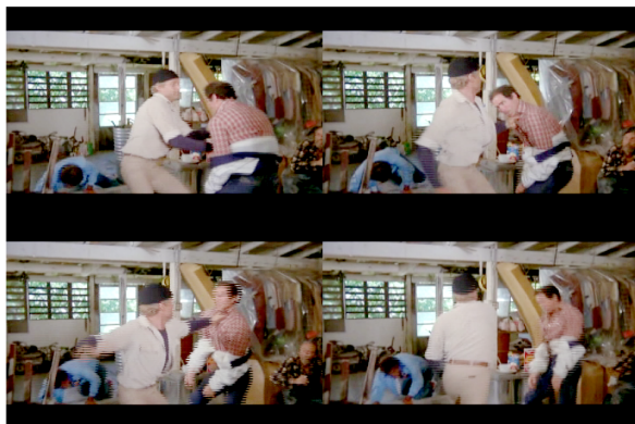
Fig. 3. Example of a fight sequence from an action movie.