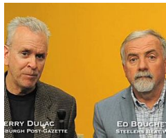
Steelers Report NFL Draft